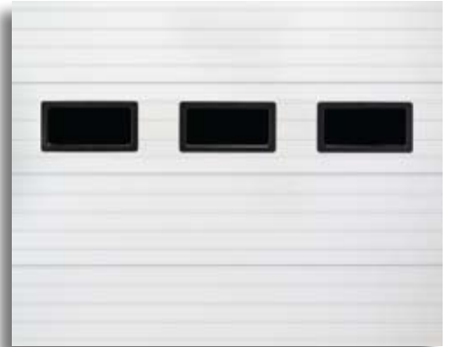
24" x 12" INSULATED GLASS LITES