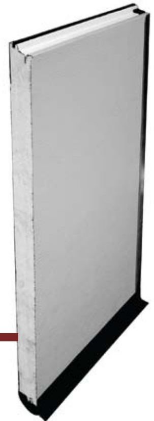
CROSS SECTION VIEW